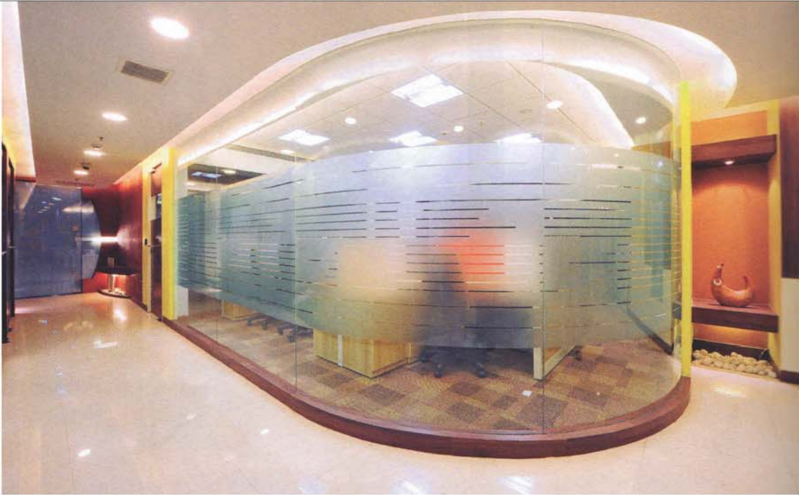
The enclosed semi-circular glass cabin neatly segregates the corporate and the production zones.