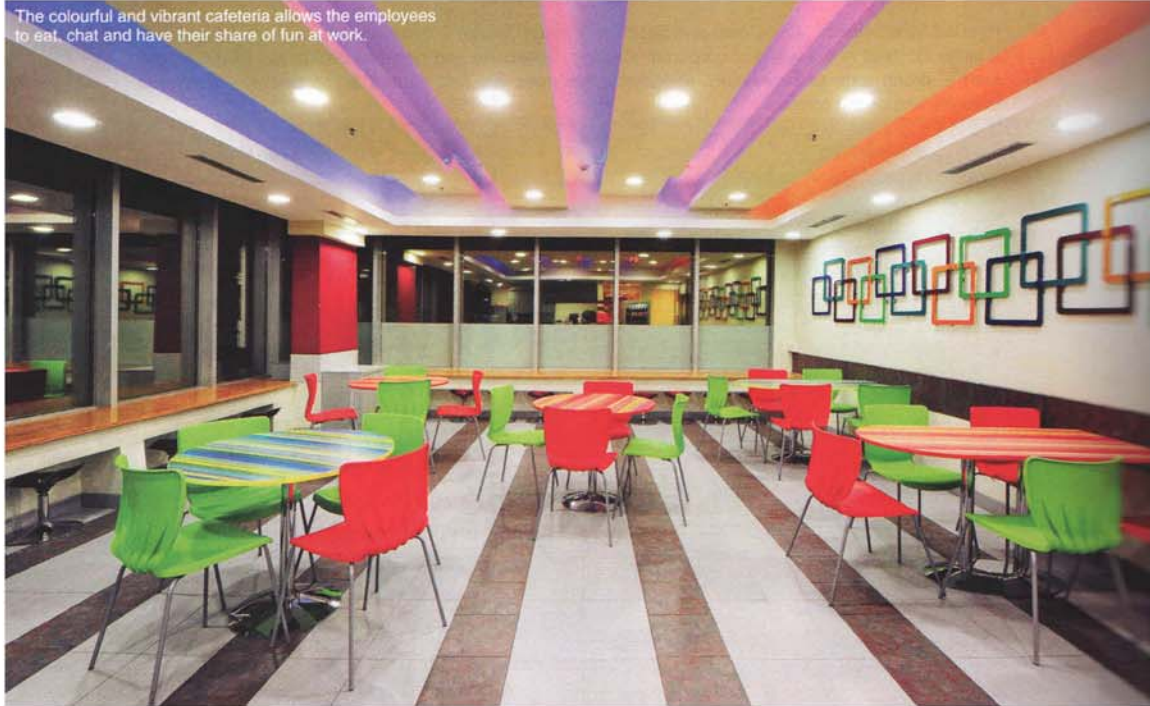
The colourful and vibrant cafeteria allows the employees to eat, chat and have their share of fun at work.

zones. The frosted glass enclave seats HR executives; the grey carpet in the area is equipped with acoustic properties and helps absorb the noise. The frosted films on the glass help maintain privacy as well.