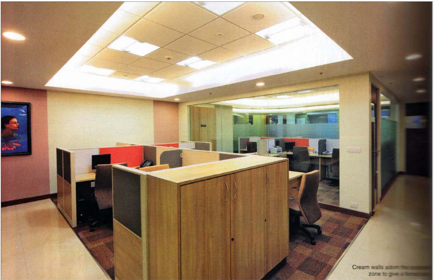
Cream walls adorn the workstation zone to give a homely feel.