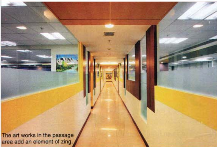
The art works in the passage area add an element of zing.

curtains supporting space frames from this sixth-storey space can quickly turn a rough, long day into a better one. The formal code sort of takes a break through the passage as cream walls flaunt massive artworks. No wonder then the pathway has many take-a-break and gaze-at-the-wall frames splashed with radiant hues.