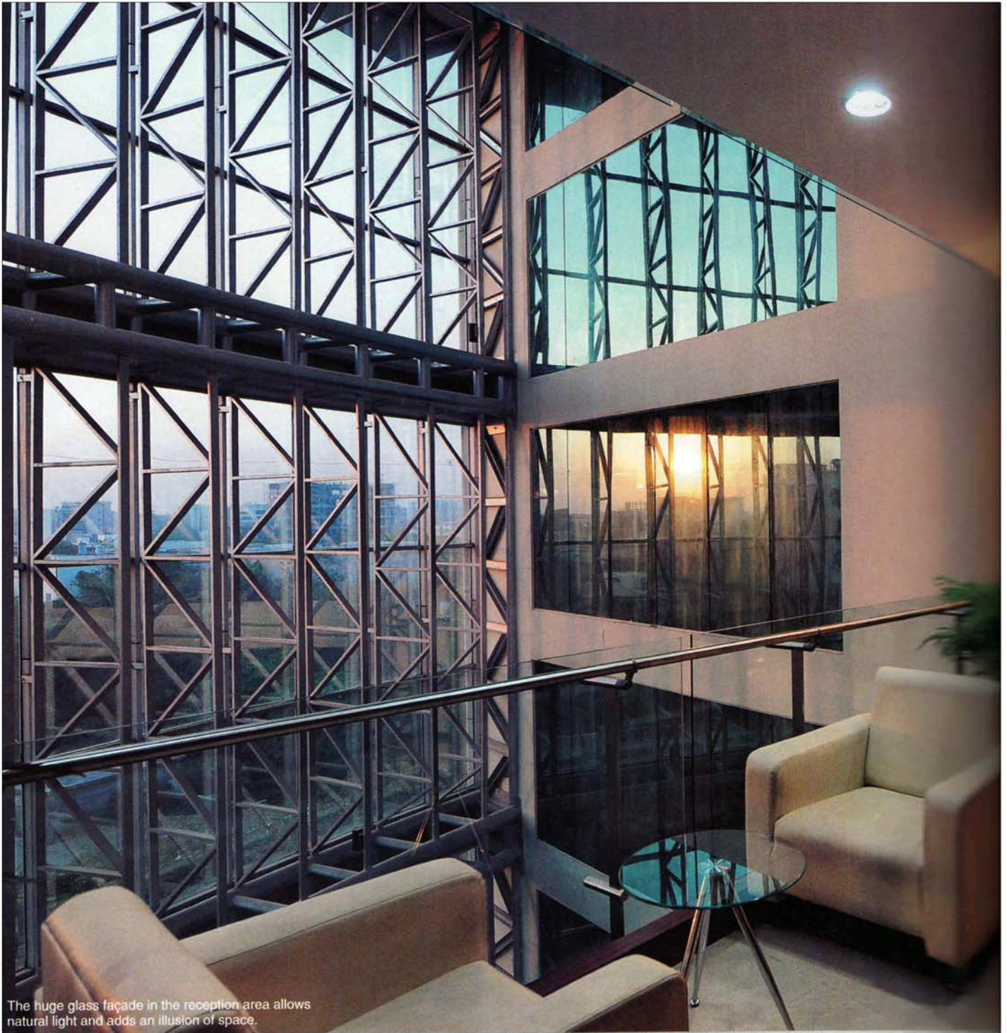
The huge glass façade in the reception area allows natural light and adds an illusion of space.