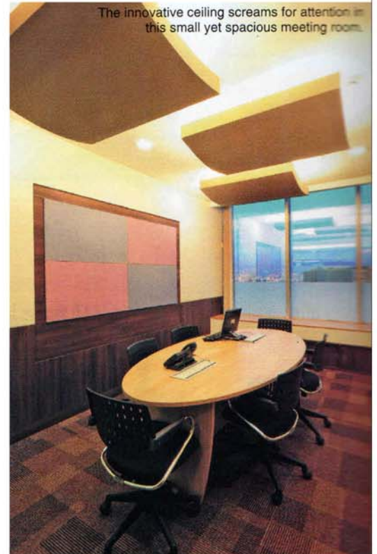
The innovative ceiling screams for attention in this small yet spacious meeting room.

The production zone is a simple functional space with a glass frontage that brings in natural lighting during the day. The workstation encapsulates deafening silence maintained with the