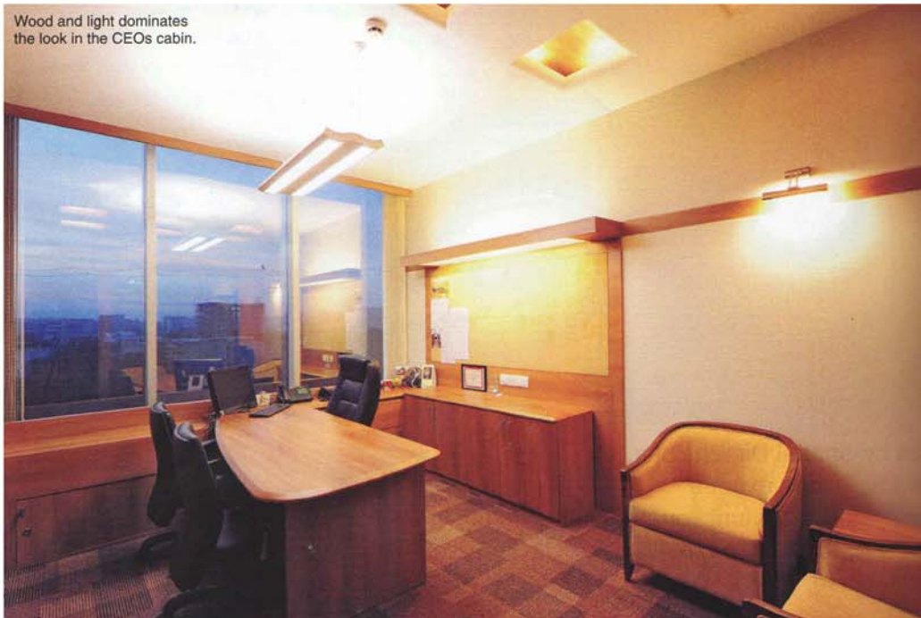
Wood and light dominates the look in the CEOs cabin.

The cabins seating senior managers boast of interesting light fixtures that reflect just about enough light. The view of glass